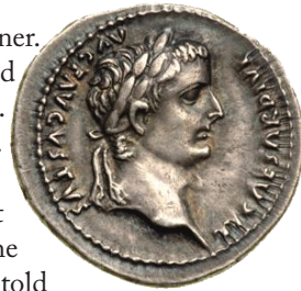
Tiberius is on a denarius coin.

10 “Those who came at first thought they should be paid more. However, they each got a day’s pay like the others. 11 When this happened, they complained about the landowner. 12 They said, ‘Those that came at the end only worked for one hour. They got the same pay as those who suffered the whole day in the heat.’ ”