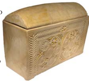
This chest contains the bones of the high priest Kaiaphas.

58 Peter followed behind from a distance in the courtyard of the high priest. When he went inside, he sat with the officers to observe the final events.