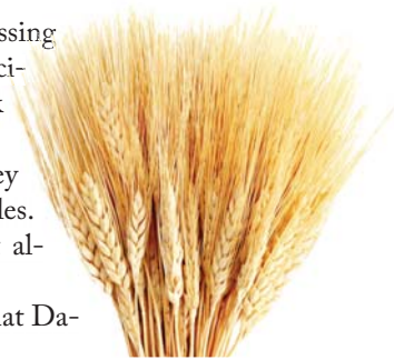
Wheat grain grows on a stalk.

6 “I tell you this: There is someone here that is better than the temple. 7 If you understood this statement, ‘I prefer mercy over sacrifice,’ c then you would not condemn the innocent. 8 The son of man is master of the sabbath.”