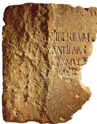
A dedication stone mentions Pontius Pilatus.

Right then, a rooster crowed. 75 Peter remembered the words of Jesus. He had said, “Before the rooster crows, you will deny me three times.”